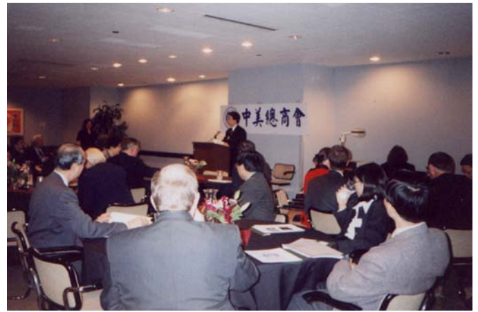
Workshops that address a variety of issues are hosted frequently by the USCCC