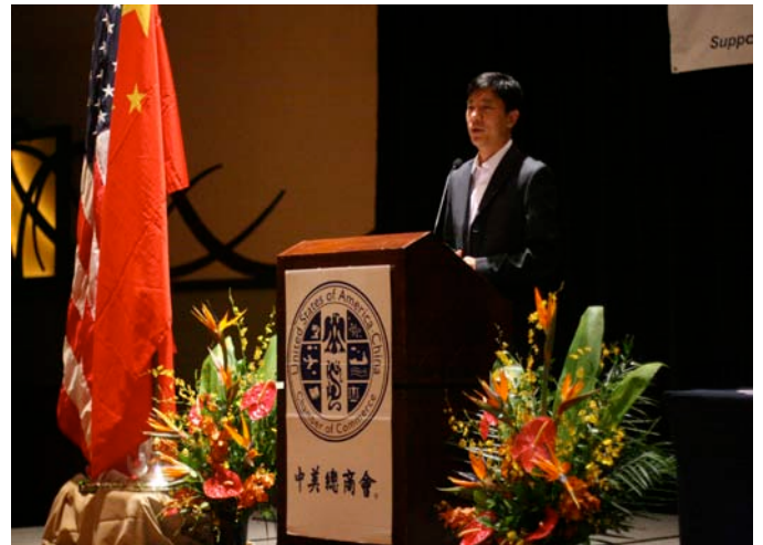
Li Yanhong, Founder, Chairman and CEO, Baidu talked about the impact of e-commerce on the economy of China